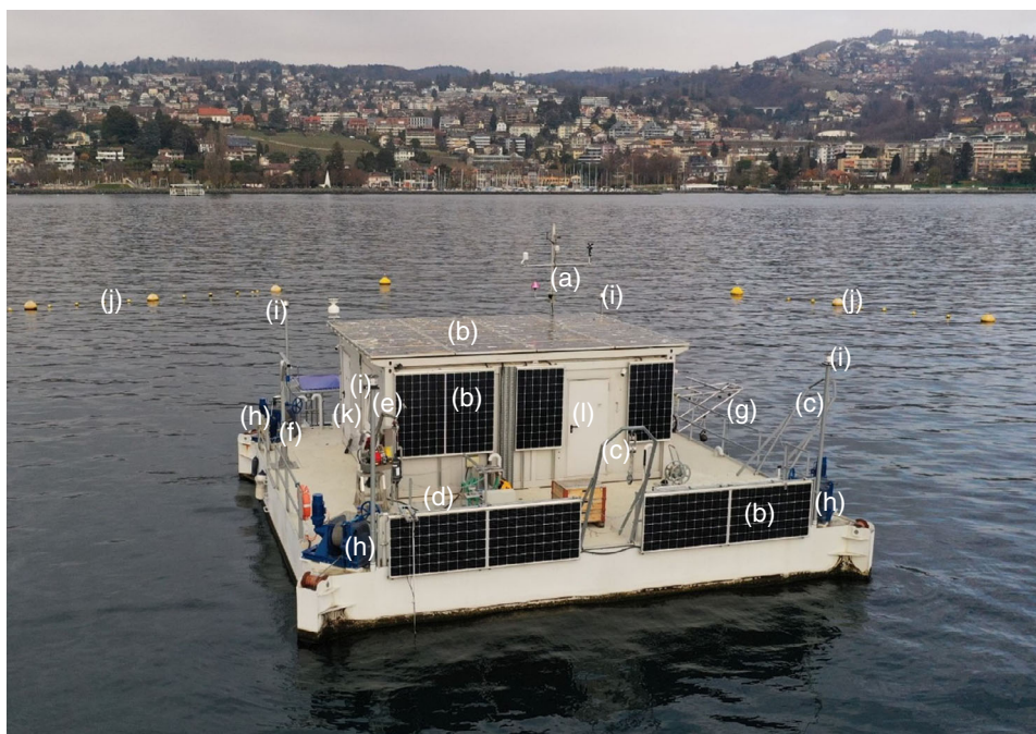
FIGURE 1 Side view of LéXPLORE from the south with the town of Pully in the background. The image shows the sheltered laboratory and exterior meteorological instruments (a), solar panels (b), on roof and towards south, two A-frames (c), the outdoor moonpool (d) with electrical winch (e), support frame for lifting loads (f), and the structure maintaining a thermistor chain (g). Blue anchor winches with cables for positioning rest at all four corners (h) and are mounted with navigation lights (i). The two doors access the toilet (k) and the laboratory (l). Battery banks and diesel-generator rest inside the pontoon-hull. The yellow buoys delineate the safety perimeter (j) for instrument protection.

high-quality wave and wind measurements that capture directional fetch-limited frequency spectra of wind-generated waves (Donelan et al., 1985).