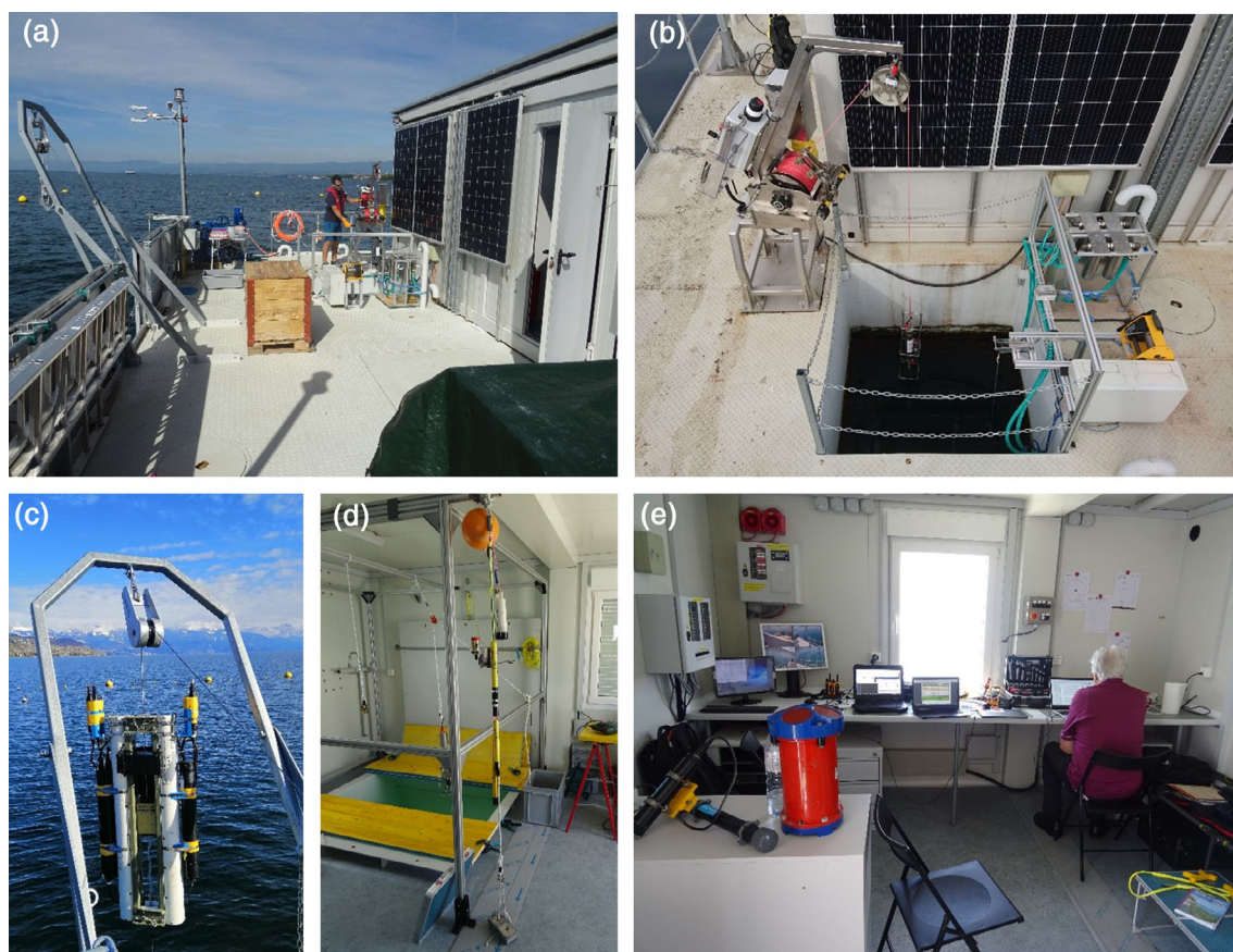
FIGURE 2 LéXPLORE elements (from top left to bottom right): (a) outdoor work area, (b) outdoor moonpool with electric crane (left) and pump system (right), (c) Wirewalker deployment using an A-frame, (d) partially covered indoor moonpool, and (e) office work area

contribute to uncertainties in piston velocities including (a) lateral and temporal variability of wind forcing, (b) interactions of wind-induced and cooling-induced turbulence, and (c) fluctuations in surface wave-affected gas transfer (Deike & Melville, 2018; Reichl & Deike, 2020). In addition, the scale of vertical and temporal variations in gas concentrations in the upper few tens of centimeters of the water column (Watson et al., 2020) and sub-daily variation in near-surface stratification and gas transfer velocity from intermittent wind, waves, and heat fluxes can obscure detection of forces driving gas transfer. These dynamics demonstrate that both concentration gradients (driving force) and turbulence levels (transfer velocity) vary considerably over short time scales of less than a day. Gas fluxes represent the instantaneous product of these processes and thus vary on the same time scales.